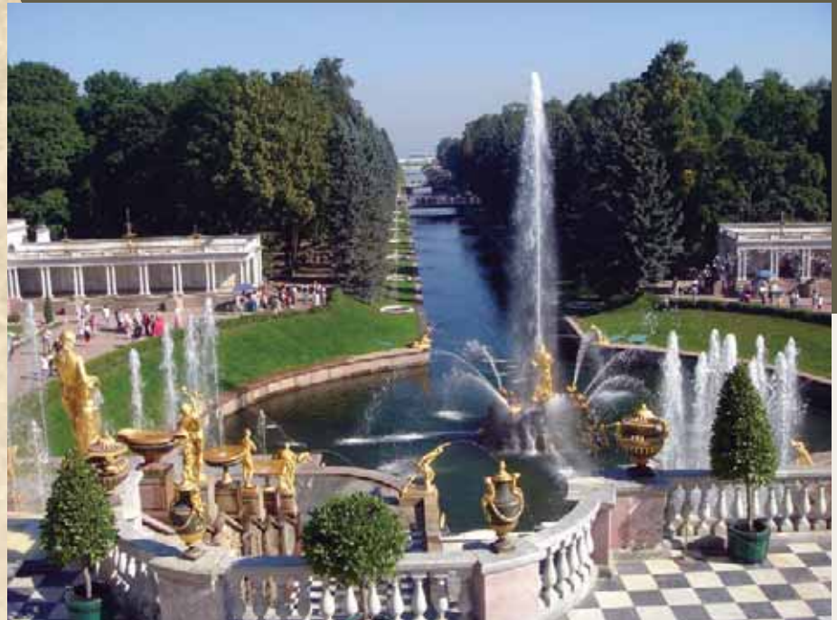
Grand Cascade at Peterhof

T his indispensable introduction to Russia's two great cities gives an insider's view of the real Russia, spotlighting not only the glittering palaces and dignified official edifices of the Russian Empire, but a matrioshka doll factory in Sergiev Posad, Stalin's underground bunker, and the unforgettable warmth of a meal in a Russian home.