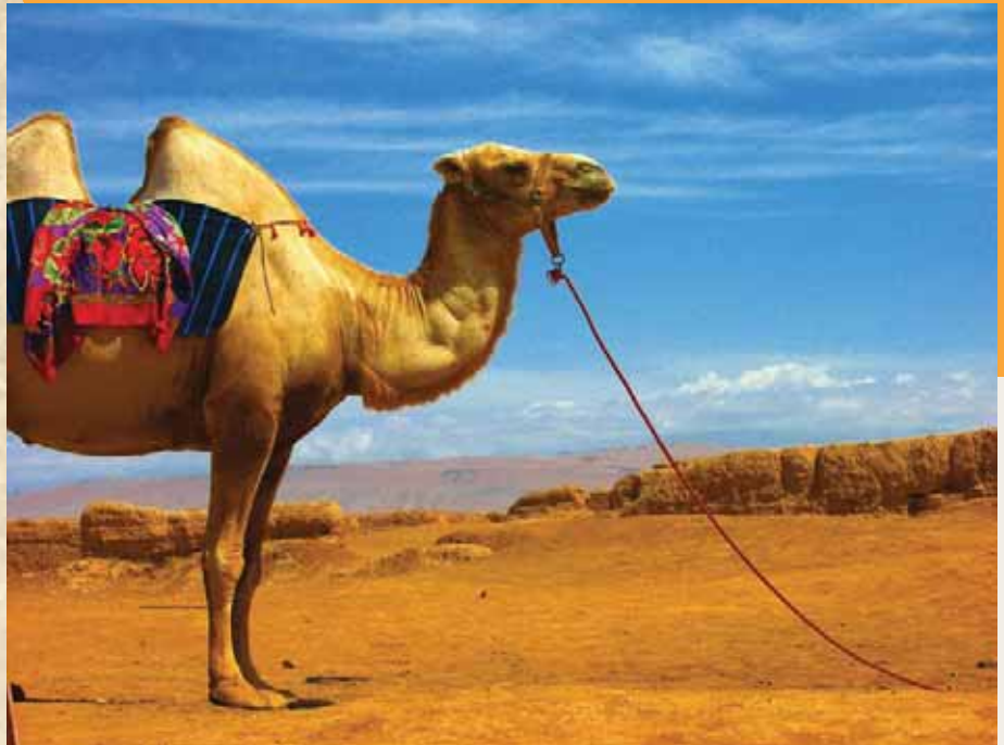
Tethered in Turpan