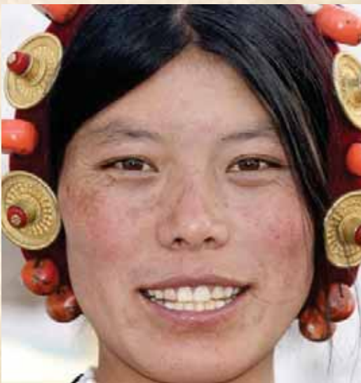
Ethnic coral headdress