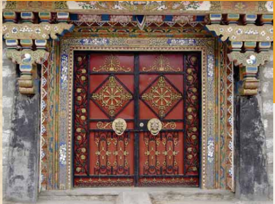
Tibetan temple doors

Stay a little longer... Extend your stay in China. Contact us for details.