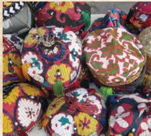
At the cap-makers' bazaar

Stay a little longer... Combine this tour with a customized extension to Tajikistan – ask for our suggested tour.