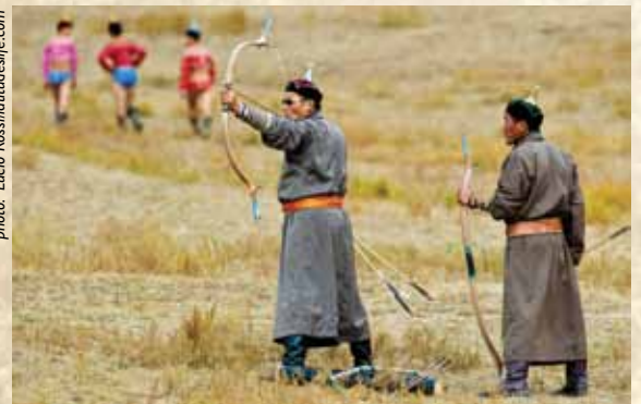
Archery is a time-honored skill in Mongolia