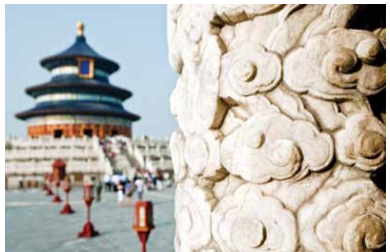
Sculpted marble pillars in multiples of nine at the Temple of Heaven

the present-day route was completed. Transfer to a hotel for a night in Irkutsk, and get to know this important Siberian way station for expeditions and exiles. Wander the open-air Museum of Wooden Architecture, a collection of authentic Russian and native Buryat, Evenki and Tafalar houses and community buildings dating from the 17th to the early 20th century.